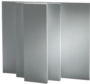
SKAMOTEC 225 building boards can easily be cut into any shape and size.